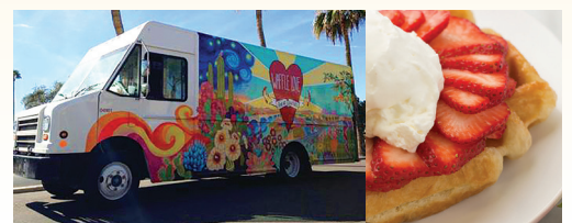
FREE Homemade Waffles by WAFFLE LOVE!